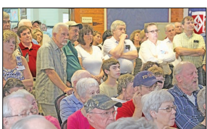
This is a meeting with the GDOT representatives, who at the time were seeking public comments on the proposed closure of Lake Winfield Scott Bridge